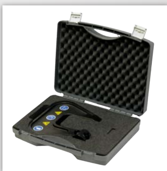
Rivet Clamp NB 115