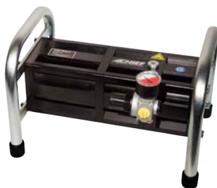
Pressure Intensifier PNP90