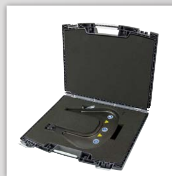
Rivet Clamp NB 115