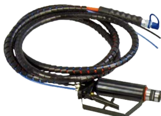
Hydraulic Gun HP 35 UN