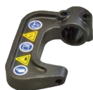
Rivet Clamp NB 40