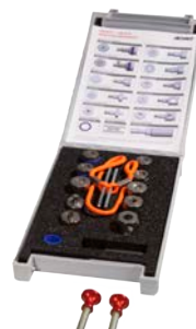
Riveting Tool Kit Locking Bolts